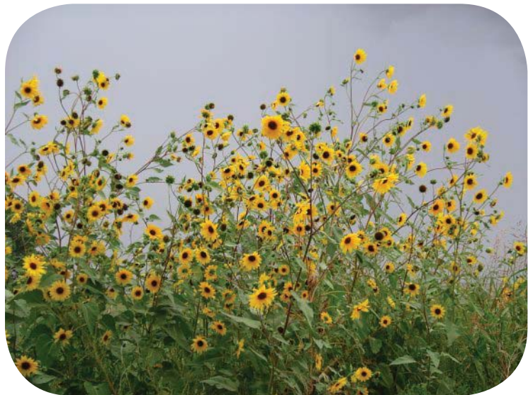
Sunflowers at the Refuge

* This poetic form contains at least 5 couplets rhyming and repeating. All must be the same meter, each couplet must be a complete sentence or several sentences, and traditionally it is about unattainable love.