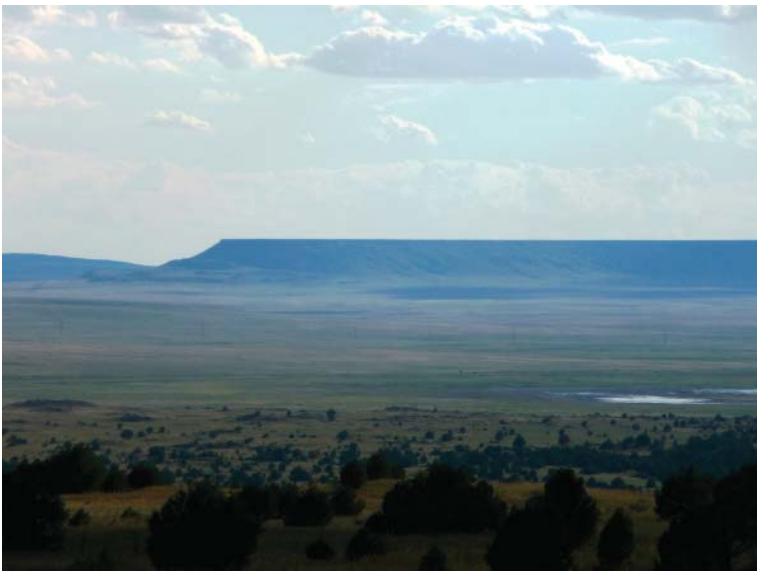
Mesa in northern New Mexico

Mesa - table. Mesa is the word commonly applied to steep-sided, flat or table-topped hills or mountains capped with a resistant rock layer, often lava. Just to the south of the refuge and east of the Rio Grande, Black Mesa is easily visible from Highway 1. A small cone-shaped vent on the top was the source of the lava flow that "holds up" this feature. [Spanish travelers on the Camino Real del Adentro (royal road of the interior)