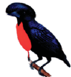
Bare-necked Umbrella Bird

Whether or not you've been to Costa Rica before, there will be new surprises in this land of pura vida. For further information go to www.holbrooktravel.com/FriendsoftheBosque . Clicking on "download itinerary" provides more details.