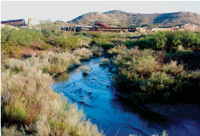
BNSF derailment and spilled VGO

This has been a busy past few months with changes, events, and new projects occurring just about every week. Some of these were fortunate, while others were not so fortunate.