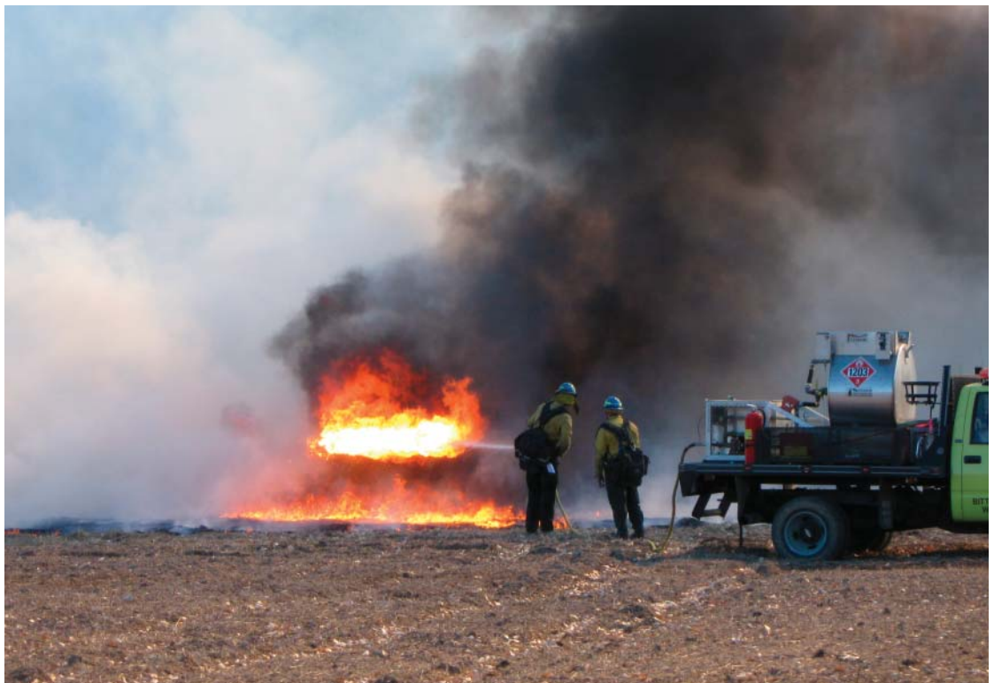
Fire crew members use a terra-torch during a prescribed burn.

The workshop (FR63) is Friday, November 19, from 10:30 am to 1:00. It will give participants an opportunity to see first-hand how it's done, weather permitting.