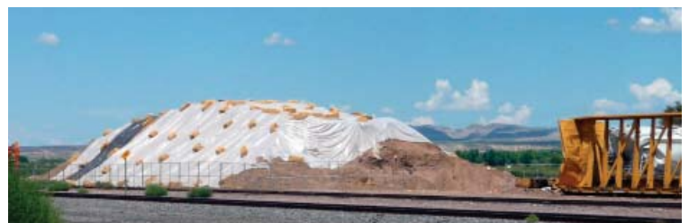
Contaminated sediment at BNSF San Antonio maintenance yard