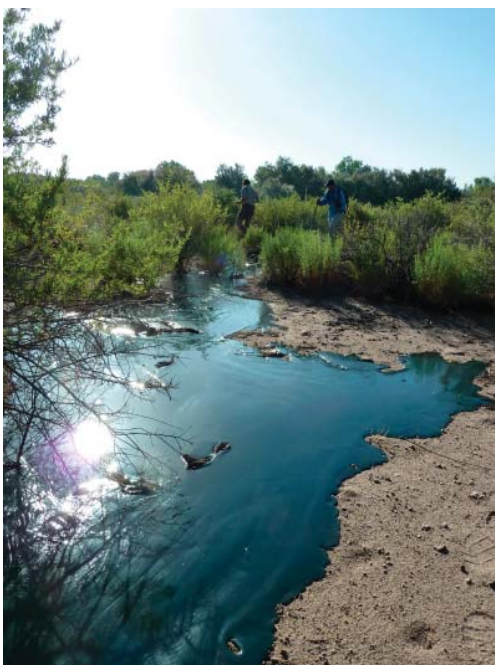
Vacuum Gas Oil in dry arroyo

In response to the Gulf tragedy, the Friends have acted. The other Friends groups associated with New Mexico National Wildlife Refuges joined the Friends of the Bosque in writing to the incoming CEO of BP. We appealed to BP to “clearly and publically accept full financial responsibility for remediation of affected wildlife and wildlife habitat from the damages caused by the Deepwater Horizon accident.”