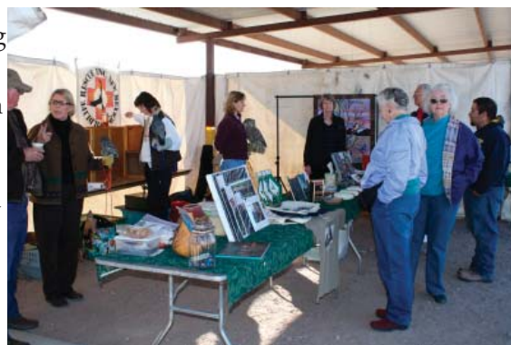
In the Art Tent, Festival 2009

If you've been to a Festival in the past, you know what great experiences are in store. If you haven't, come and find out. Thanks for registering--and thanks to all of you who volunteer your time and talent to make it possible. This year promises to be the best yet!